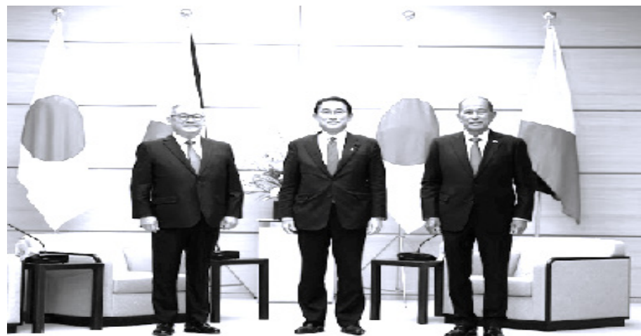
Secretary Locsin and Secretary Lorenzana

WARNING: IT IS ABSOLUTELY PROHIBITED TO REMOVE DEFACE, OR DESTROY THIS NOTICE OF EXTRA-JUDICIAL SALE ON OR BEFORE THE DATE OF SALE